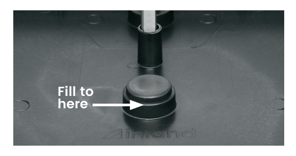
Fig. A *WizCG reservoir is pictured, WizlingCG reservoir is maroon

A water/coolant mixture prevents airborne glass dust, increases grinding speed, and prolongs the life of the diamond surface on the grinder bits. Coolant is also required when using any diamond tool. Remove the work surface, then pour 12 ounces (1½ cups) of clean water into the coolant reservoir. Only fill to the ridge on the coolant level indicator located in the middle of the reservoir (Fig. A). Optionally, you can add a capful of Inland Craft diamond coolant (not included) to increase diamond bit life and grinding speed. Replace the work surface.